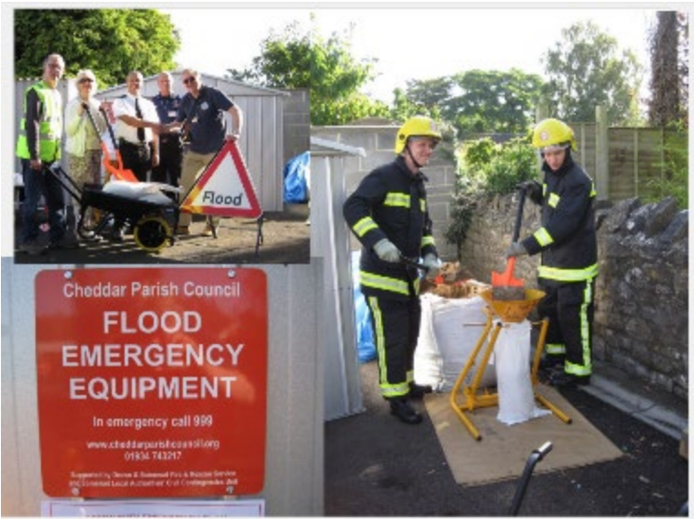
(Left) Cheddar is one of the EA's rapid response catchments. Cheddar Parish Council received support towards the costs of sandbag filling device and other flood equipment.