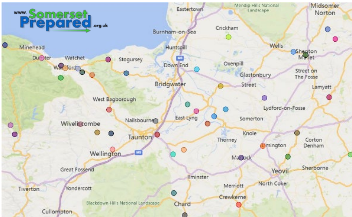
Map showing distribution of Somerset Prepared small grants up to 2024-25. Note: some communities have applied for more than one grant.