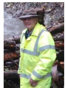
Martock Flood Group received grants in 2015-16, 2021-22 and 2022-23 for flood equipment including hydrosnakes and other flood barriers.