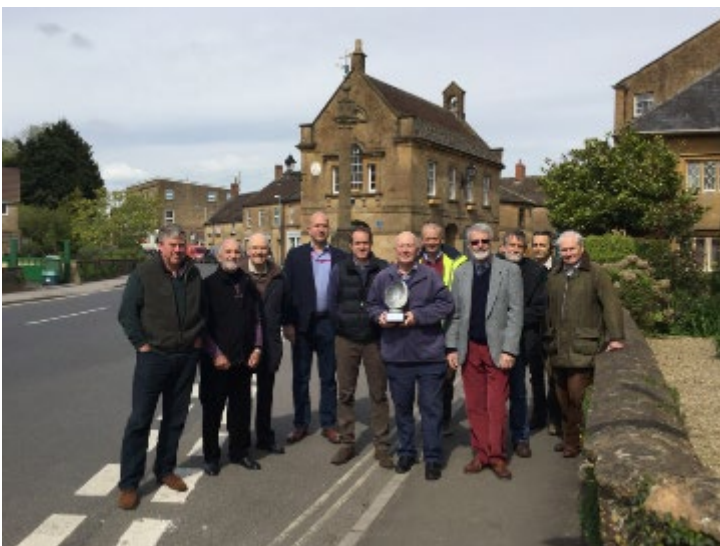
The village of Martock is regularly affected by flooding. Martock Flood Group are very active and experienced and regularly deploy to help protect their community.