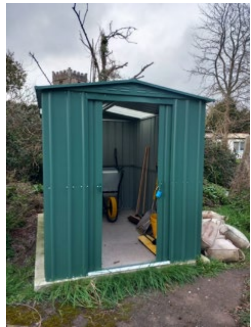
(Right) Sampford Brett, near Williton, is subject to surface water flooding. Sampford Brett Parish Council used their grants in 2018-19 and 2023-24 to buy equipment including flood sacks, tools and PPE. And a shed to store the equipment in for quick access during a flood.